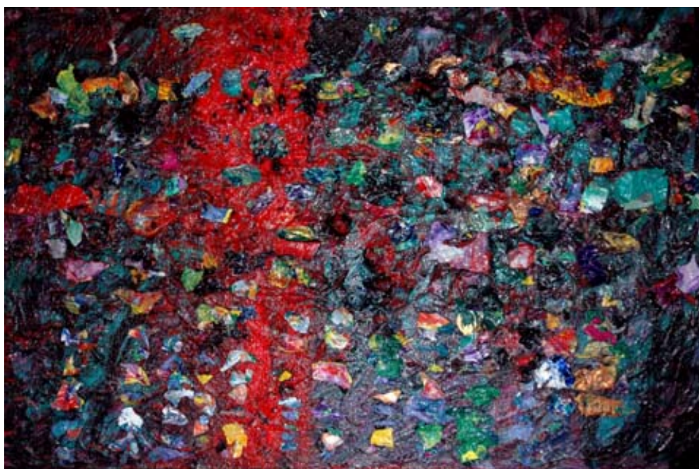
Color of Life

WESTIN HOTEL, O'HARE CHICAGO ART GALLERY EXHIBIT MAY 20-24