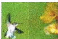
Greg Wells Burkesville